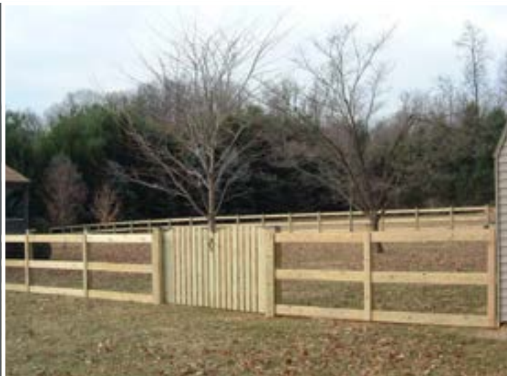
3-Board Paddock Fence