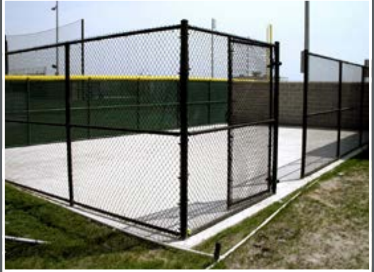
Black Commercial Chainlink