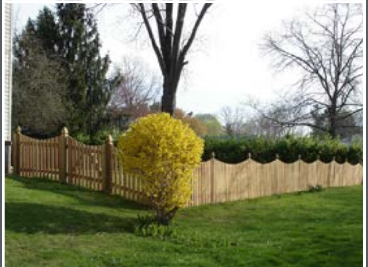
Dip Top Picket on Gothic Post