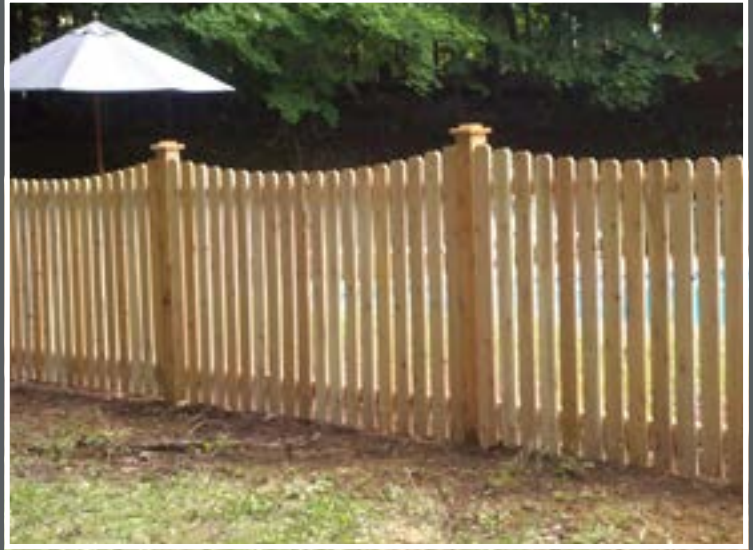
Dog Ear Picket with Dip Top