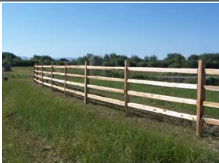
4-Rail Split Rail Fence