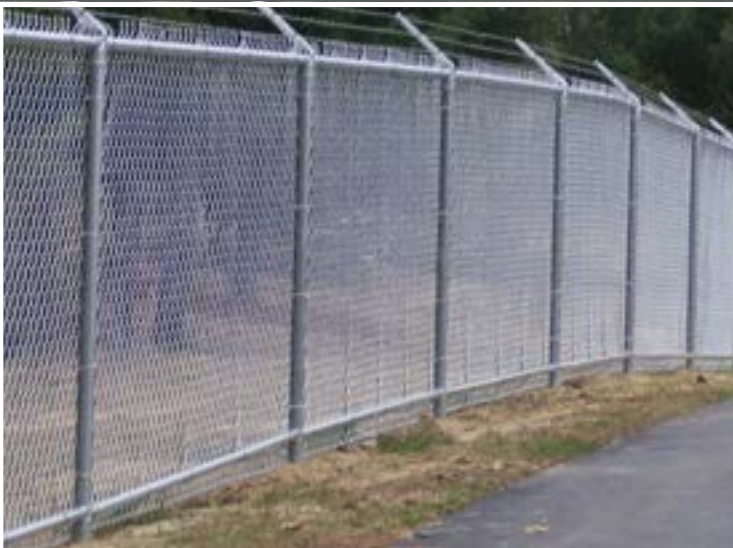
Commercial Galvanized Chainlink with Barbed Wire