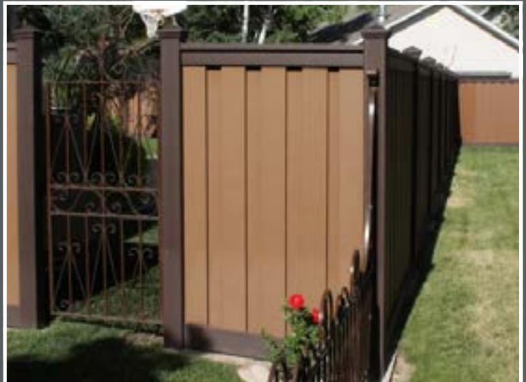
Trex Seclusions 2-Tone Saddle & Woodland Brown