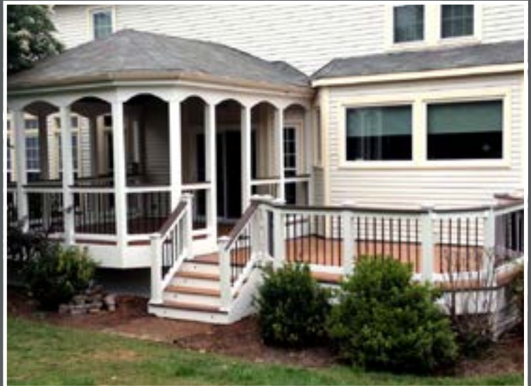
Screen Porch with Deck