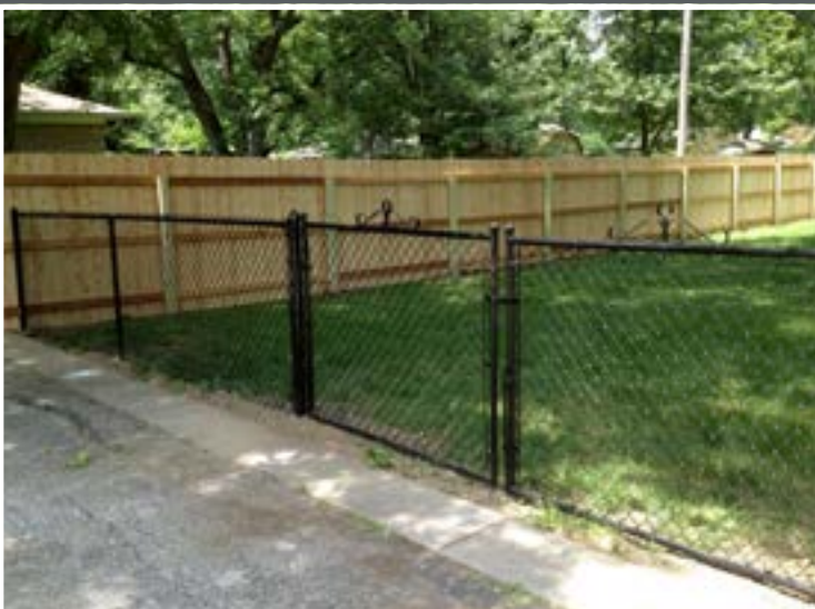
Black Chainlink with Gates