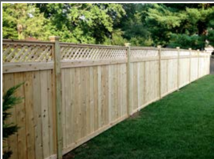
Solid Board with Lattice Topper