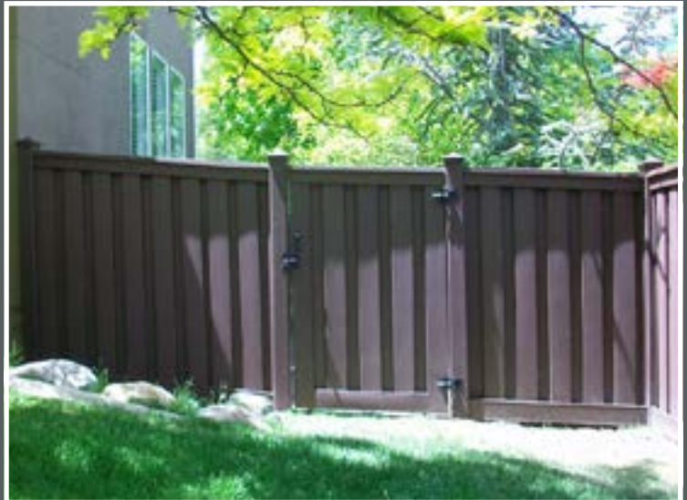
Trex Seclusions Winchester Grey Color