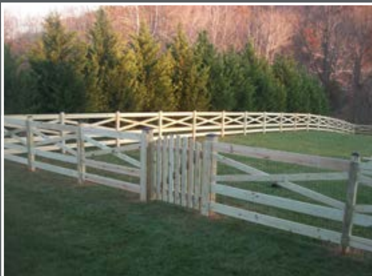
5-Board Estate Fence