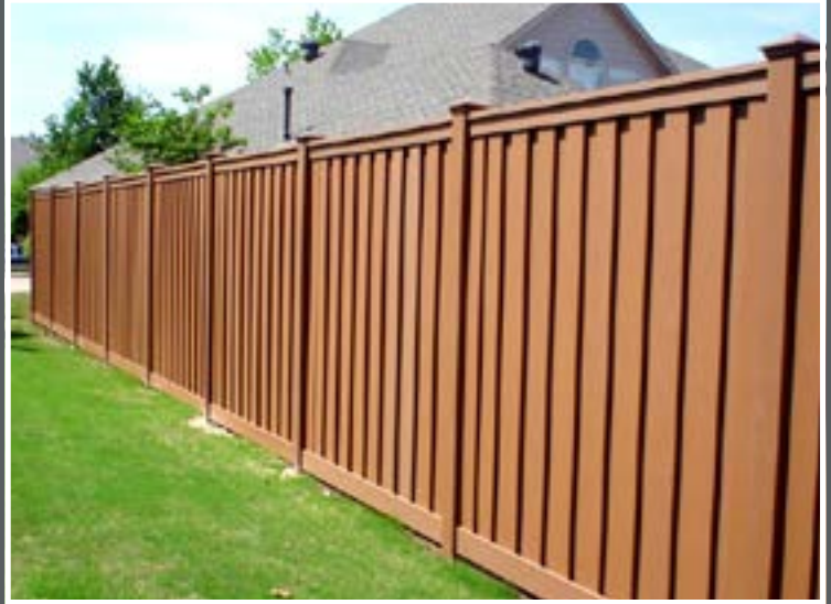
Trex Seclusions Saddle Color