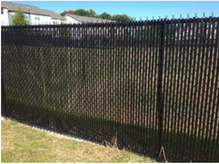
Black Chainlink with Slats