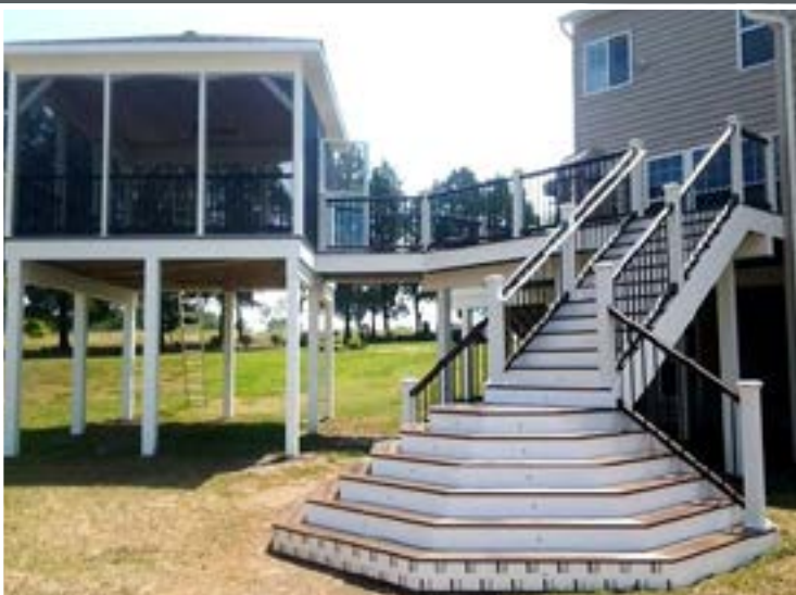
Screen Porch with Deck