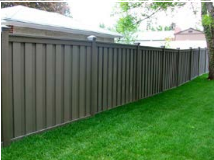
Trex Seclusions Winchester Grey Color