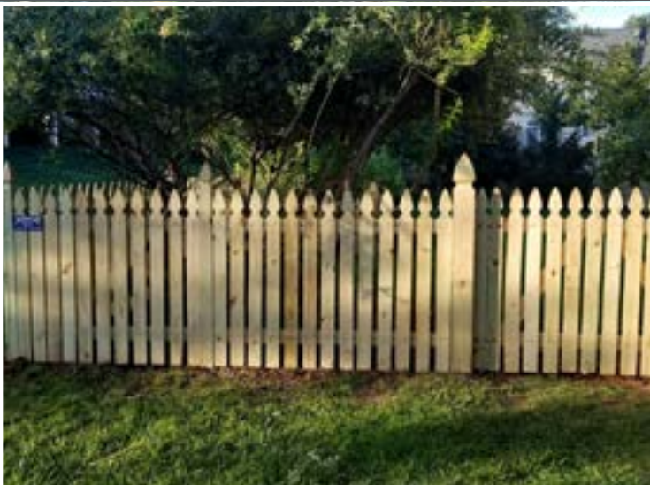
Colonial Gothic Picket on Gothic Post