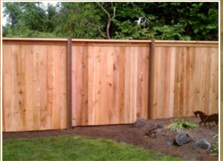
Cusotm Cedar Solid Board Fence