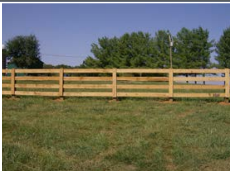
4-Board Paddock Fence