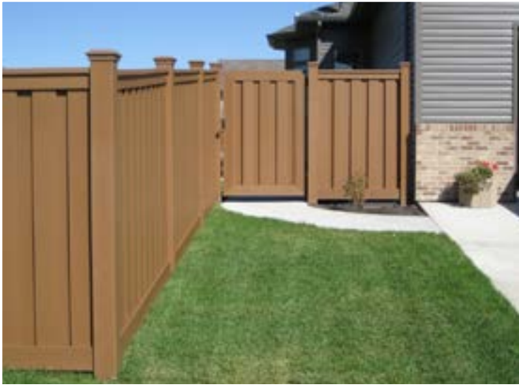
Trex Seclusions Saddle Color