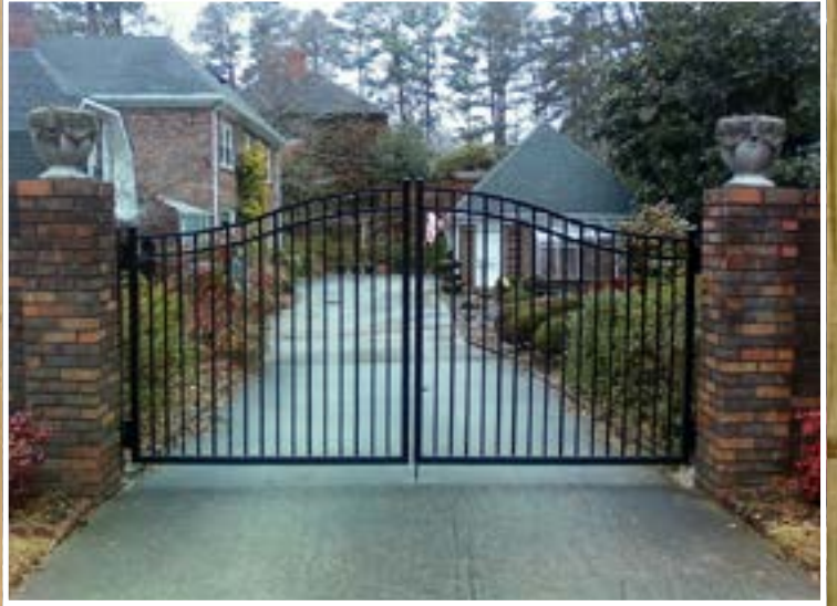
Ornamental Entry Gate