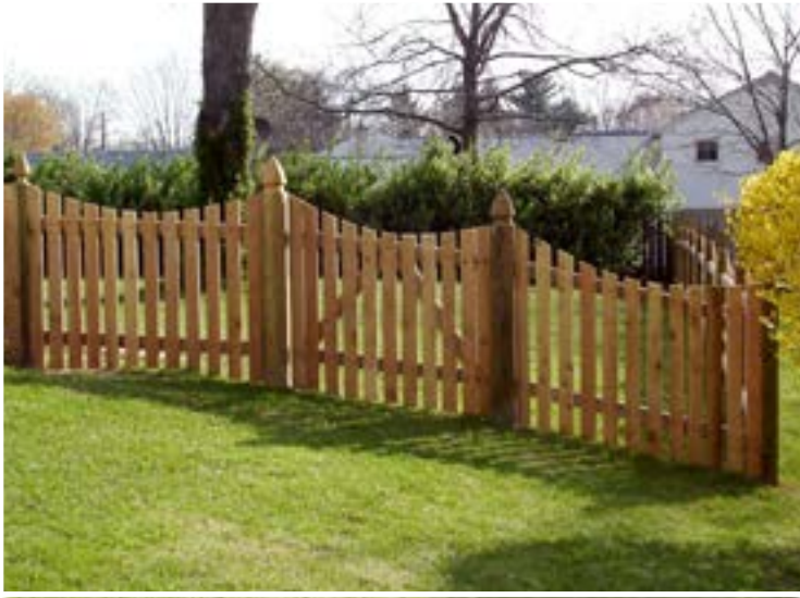
Dip Top Picket on Gothic Post