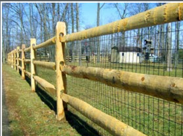
3-Rail Split Rail with Wire