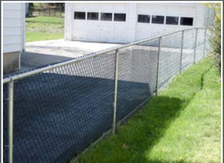
Black Chainlink on Galvanized Frame