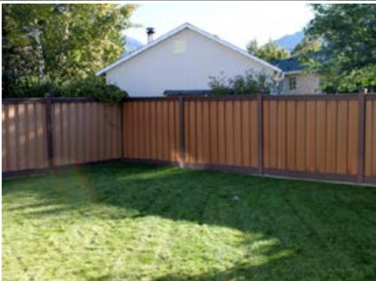
Trex Seclusions 2-Tone Saddle & Woodland Brown