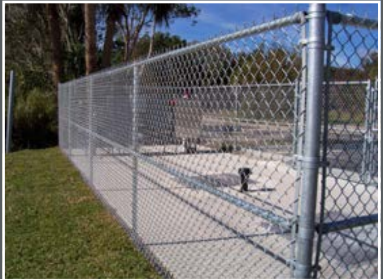
Commercial Galvanized Chainlink