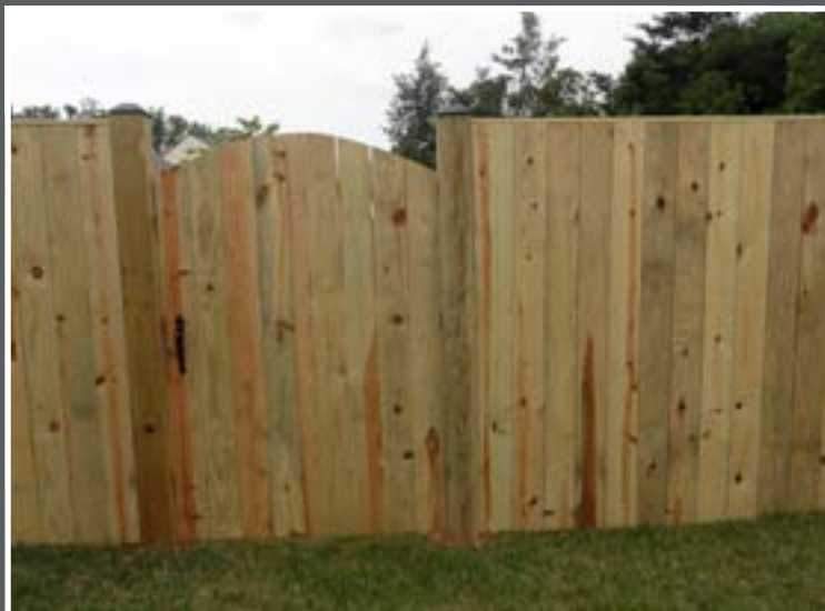
Solid Board with Arch Top Gate