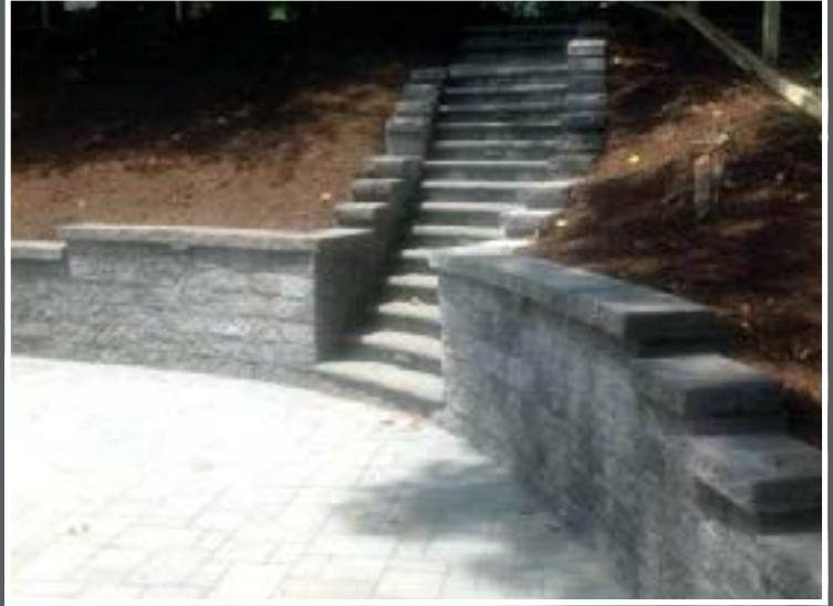
Custom Patio with Seating Wall