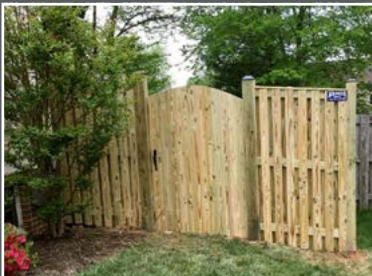
Board on Board with Arch Top Gate