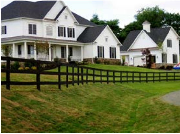
3-Board Paddock Fence