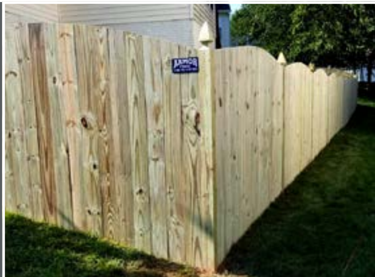
Solid Board with Arch top on Gothic Post