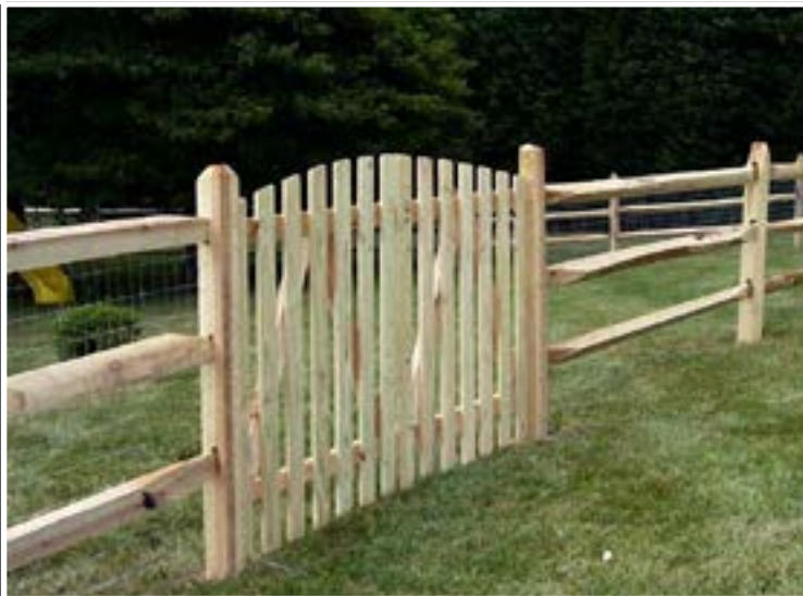
3-Rail Split Rail