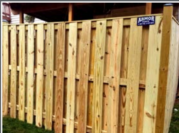
Pressure Treated Board on Board