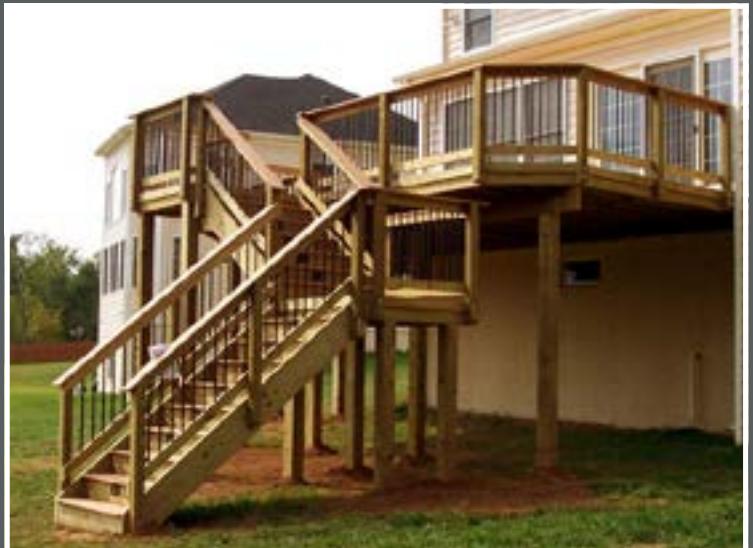
Classic Pressure Treated Deck